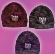
Theatre Beanie - Embroidered Masks Heathered Purple Heathered Maroon Heathered Blk/Wh