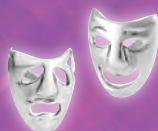
Comedy/Tragedy Earrings 1509-155 - Large