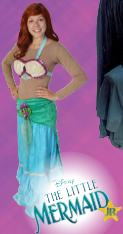
Disney THE LITTLE MERMAID