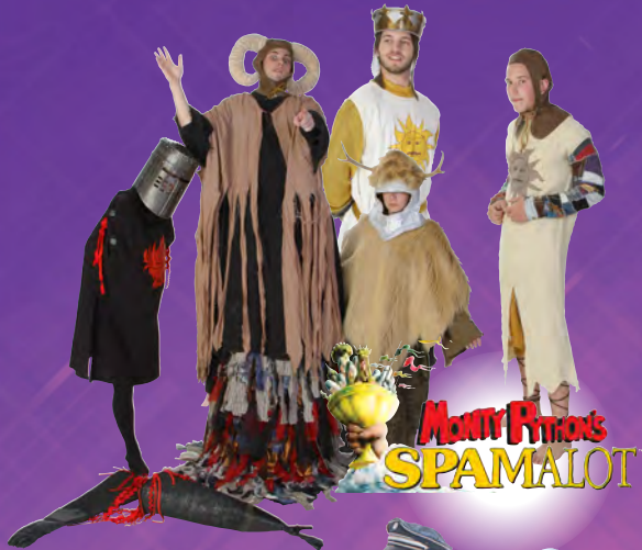
Monty Python's SPAMALOT