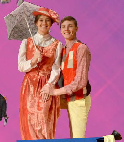
Disney and CLASSICAL MUSIC THEATRE MARY POPPINS