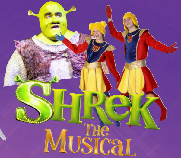
SHREK The MUSICAL