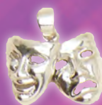
Comedy/Tragedy Charms Various Sizes