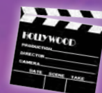
Wooden Clapboard 12" Hollywood NCB