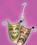
Comedy/Tragedy Ornament 963-0608