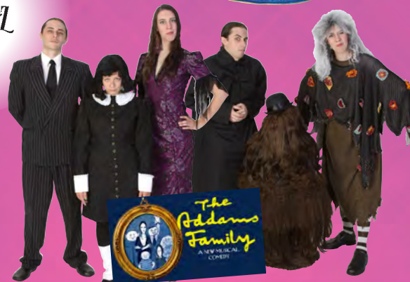
The Addams Family A MUSICAL COMEDY