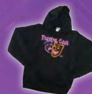
Theatre Geek Hoodie Sizes S-2XL 50/50 Blend