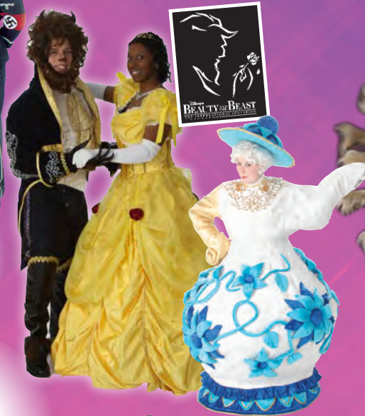
Disney BEAUTY & THE BEAST