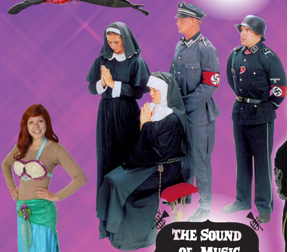
THE SOUND OF MUSIC Award Winning Musical by RODGERS & HAMMERSTEIN LINDSAY & CROUSE