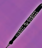
Lanyard's Black Techie with headset & wrenches White Print