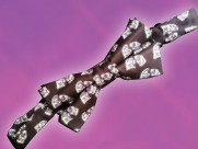
Comedy/Tragedy Bowtie W/Adjustable Band Black with White Masks