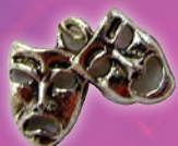
Comedy/Tragedy Necklace W/Sterling Silver Chain 18" - ONK 358