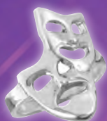
Comedy/Tragedy Stacked Ring 3790-155 Sizes 6-10