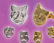
Comedy/Tragedy Cufflink & Stud Set Gold & Silver Plated