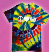
Tye Dye - Peace Love Theatre T-Shirt 100% Cotton Sizes S-2XL