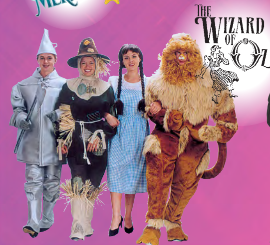
THE WIZARD OF OZ