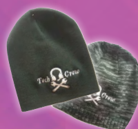
Tech Crew Beanie Blk Beanie W/Logo Heathered Blk/Wh